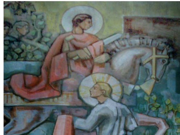
Main altar paintings