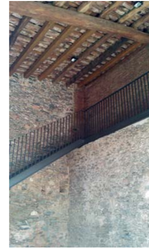
Staircase leading to the top of the tower