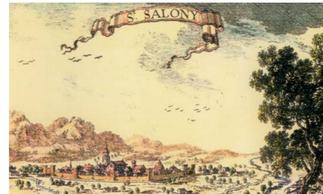
A reconstruction of the fortified town. French engraving from the XVII century

When it was no longer useful for defence purposes the wall began to decline. In 1681 the moat was divided up and sold off as vegetable plots in order to help pay for the building of the new parish church (houses were later built on these plots), and in 1865 the Girona gate also known as Sants Metges, was pulled down. After these events all that remained of the walled precinct of Sant Celoni was the dividing wall between the houses Carrer Major and those between Carrer de les Valls and Sant Roc as well as the facade of some of the houses on Plaça Bestiar. Of the five original towers only two still stand today plus the angle of a third tower. The most prominent of the two is known as Ca l'Aymar and it is perfectly visible from Plaça Josep Alfaras. The tower that was restored in 2009 is the one in Carrer Valls.