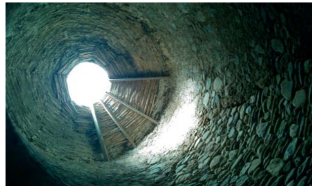
Inside dome of the tower