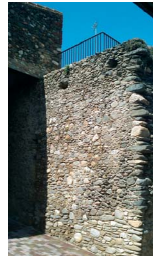
Section of the wall

The sloping base of the tower was left uncovered recovering the original ground level during the XIX-XV centuries.